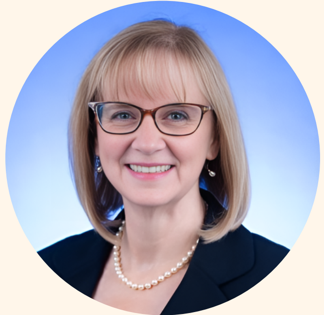
MIAMI-DADE COMMISSIONER EILEEN HIGGINS @commisheileen

In 2020, the global landscape ground to a halt in response to the COVID-19 pandemic. Just six months into this crisis, Miami-Dade County's cultural sector found itself reeling from a substantial financial blow, amounting to 112 million dollars in losses that impacted over 18,000 jobs. As theaters closed and performances halted, the arts community suffered greatly without revenue from tickets, patrons and subscribers.